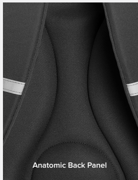
Anatomic Back Panel